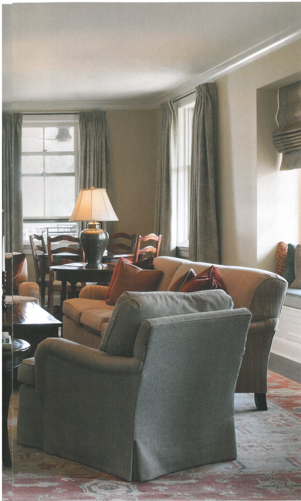
Warm reds, crisp blues and soothing neutrals make up the color palette in this comfortable family room. A rich mix of texture and finishes was used in the design of the family room.

porch allows the homeowners to take full advantage of the 270 degree views of the surrounding landscape and provides “easy flow” to the outdoor living spaces. Working with the foundation and fireplace of the original 3,800 square foot building, “the new home includes six bedrooms, a children’s study/art room and an office on the second floor”. The original four car garage was “repurposed into an exercise room and pool cabana for the new pool”. In addition to the new 8,100 square foot home, the property also includes an observation tower, separate garage/barn, orchard and vegetable garden.